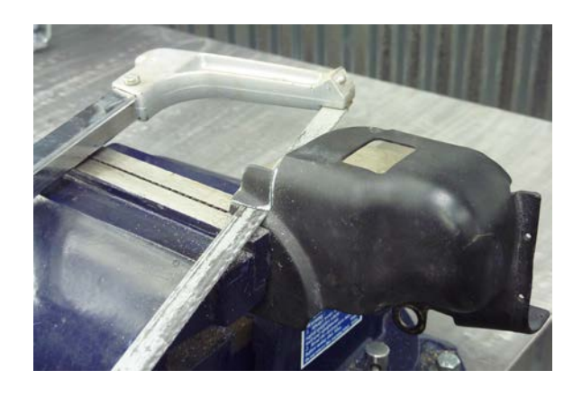
Step 5 Secure the cover in a vice and along the marks using a hacksaw (or cut off wheel).