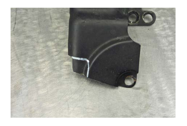
Step 4 Continued Cover shown properly marked.