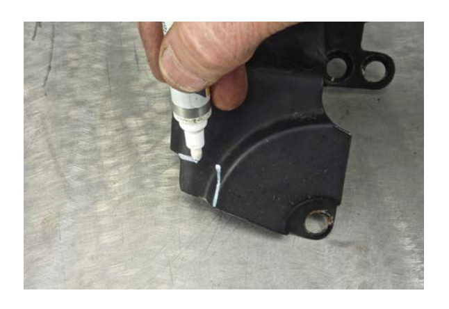
Step 4 Mark the cover as shown.