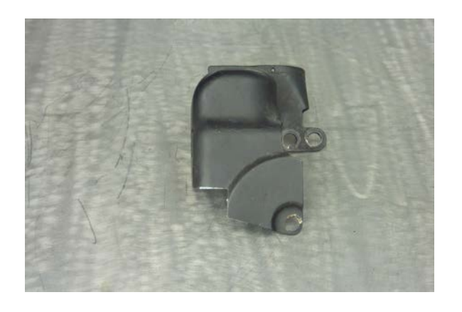
Step 5 Continued E Locker cover properly cut.