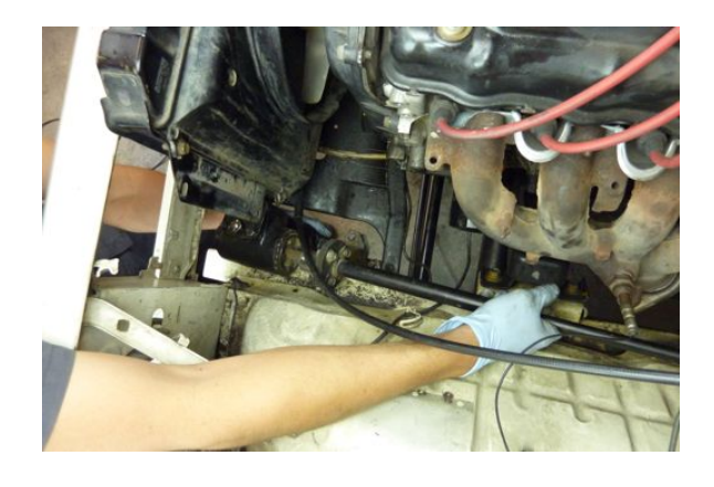
Step 10 After measuring the s

Note: It is a good idea to temporarily install the bolt in the universal joint to insure that the shaft is fitted in it's exact location for an accurate measurement.