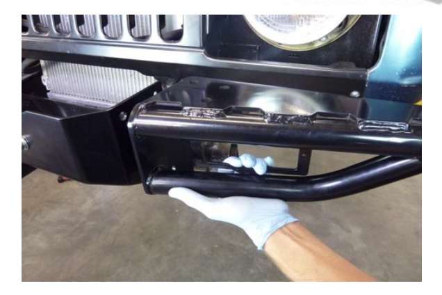
Step 38 Position the driver side tube end.

Step 37 Remove the (2) driver side cover bolts.