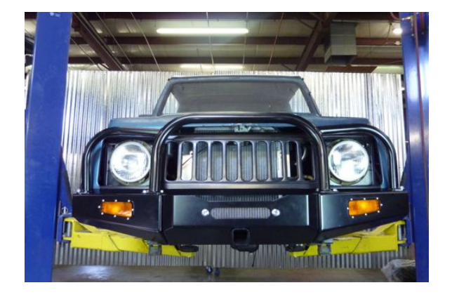
Step 45 Position the grill guard as shown.

This sections applies to the Grill Guard W/Headlight Bars Only