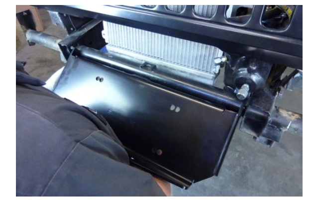
Step 2 Position the winch plate as shown.

Note: Be sure to remove the Park/ Signal lights before removing the bumper. The electrical connector can be accessed from under the hood.