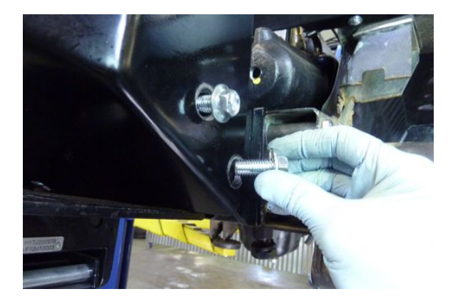
Step 28 Remove the (2) driver side cover bolts.