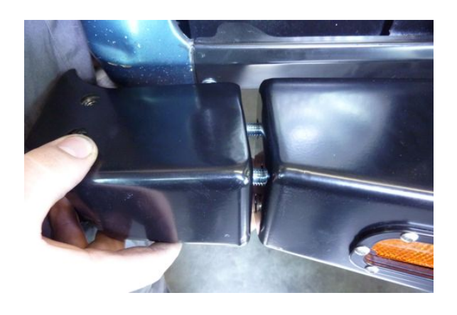
Step 36 Repeat steps 33 through 35 on the passenger side.