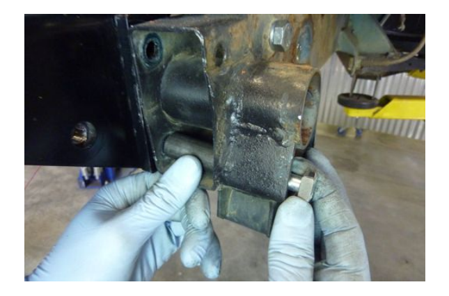
Step 7 Install the bottom (M10X1.25X90) bolt.

Note: These sleeves are carefully sized. If they do not fit inside the frame, we recommend bending the frame rather than reducing the length of the sleeve. This will result a tighter, stronger fit.