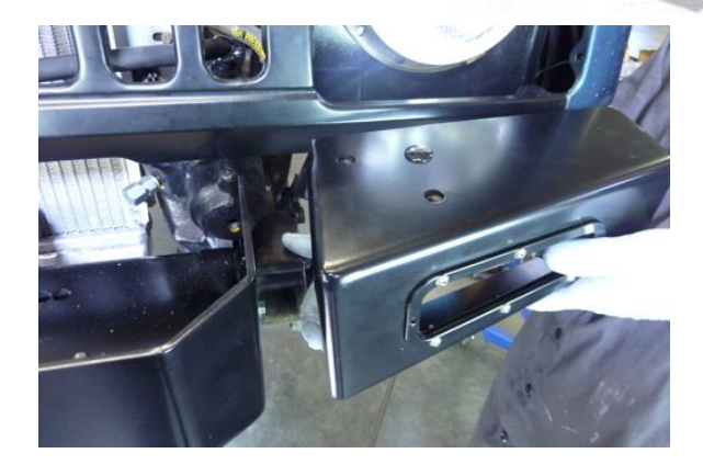
Step 29 Position the driver side short end.