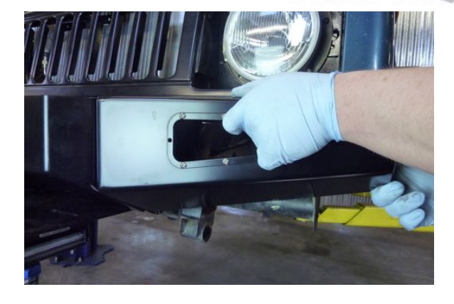
Step 24 Position the driver side long end.