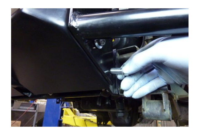
Step 39 Continued

Insert the top two (M12X1.75X25) flange bolts as shown. Do not tighten them yet.