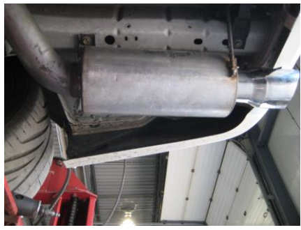
Figure 5 $7270 © 06/21