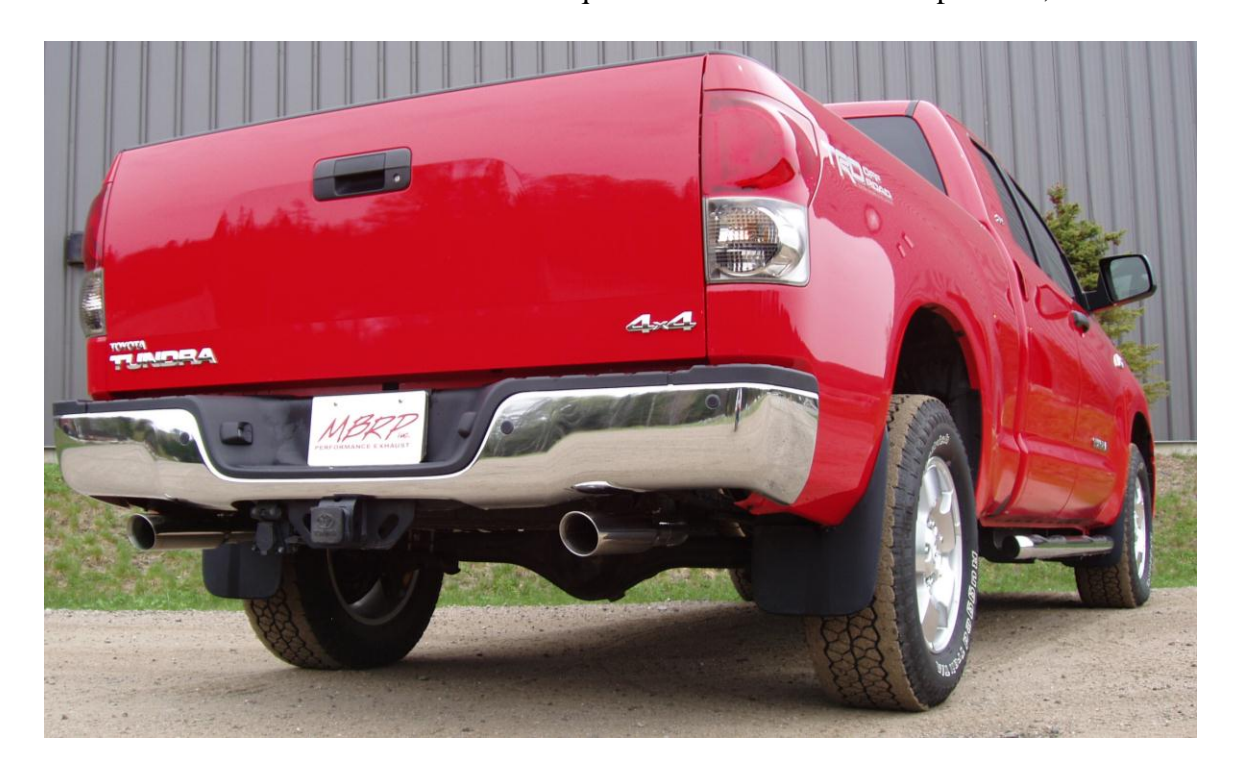
Congratulations! You are ready to begin experiencing the improved power, sound and driving experience of your MBRP Inc. performance exhaust system. We hope you enjoy your purchase.