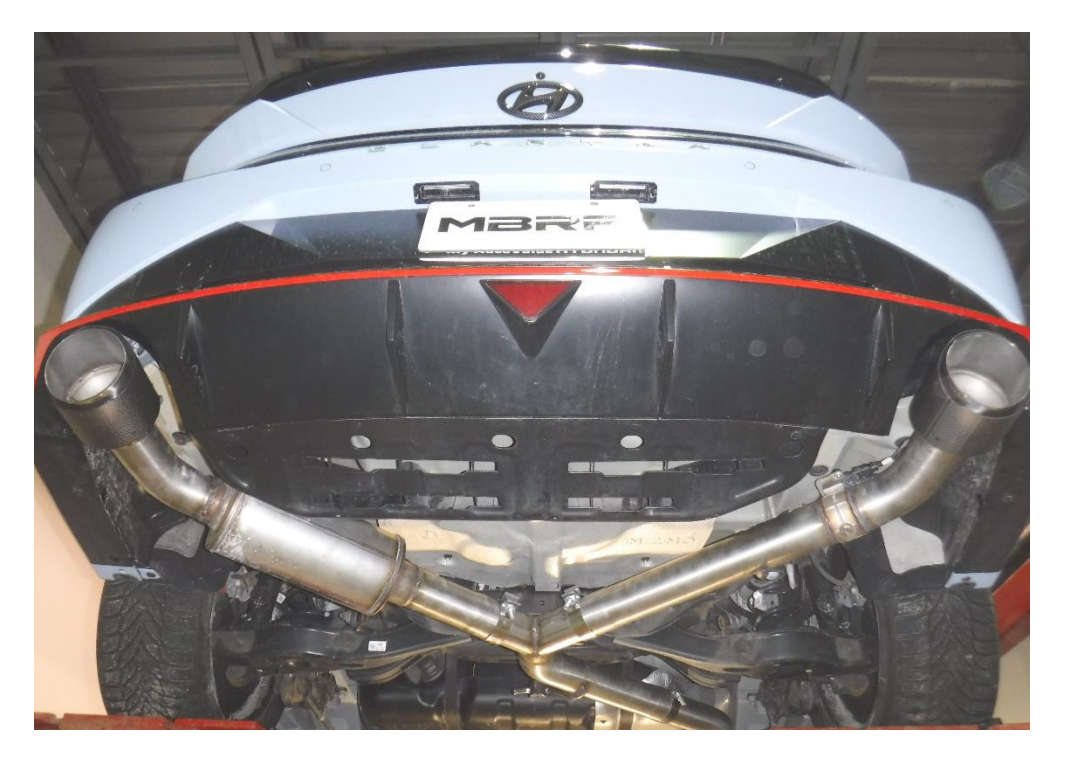
Congratulations! You are ready to begin experiencing the improved power, sound and driving experience of your MBRP Performance Exhaust. We know you will enjoy your purchase!

9. Carefully align the system, centering the Tips with the factory fascia openings. Align the edge of each band clamp with the edge of the joint it is connecting. Tighten all hardware and clamps, starting at the front and working rearward to secure the system. Check along the full length of the exhaust system to ensure there is adequate clearance for fuel lines, vent lines, brake lines, frame, bodywork, suspension and any wiring, etc. If there is any interference detected, relocate or adjust to provide adequate clearance. Ensure all clamp connections are secure and components are unable to rotate or slide. Band clamps require approximately 45 lb-ft (60 N-m) of torque. Verify clearances, system security and band clamp torque after 30-60 miles (50-100 km) of driving.