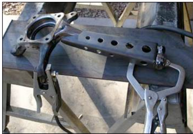
Tack the gusset to the spindle (left photo) Pictured on the right below is the finalized weld