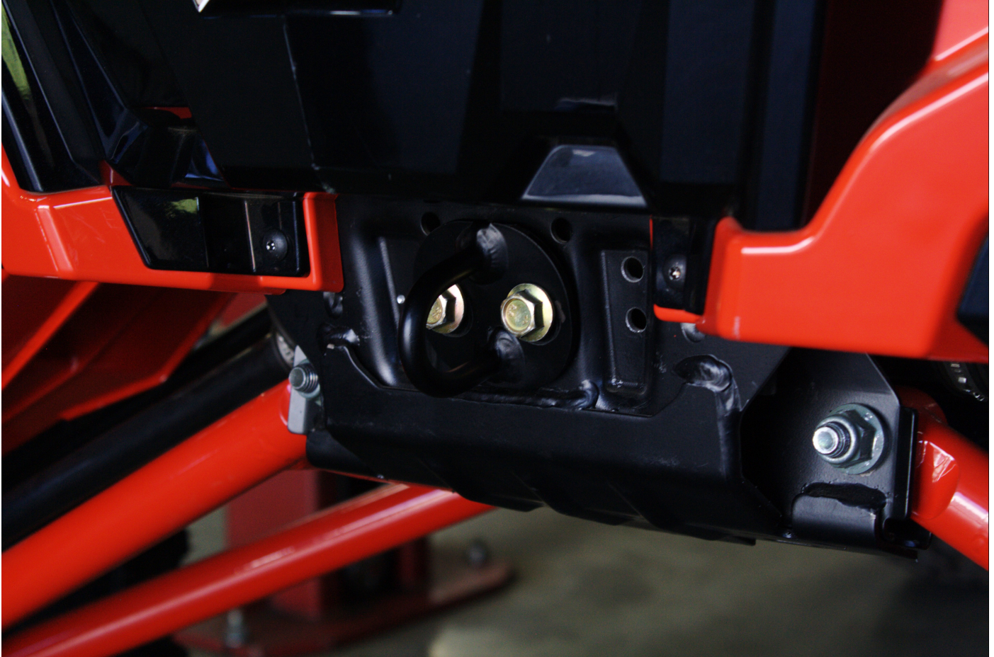
Figure 1: The OEM Tow Loop is held by two 10mm bolts.