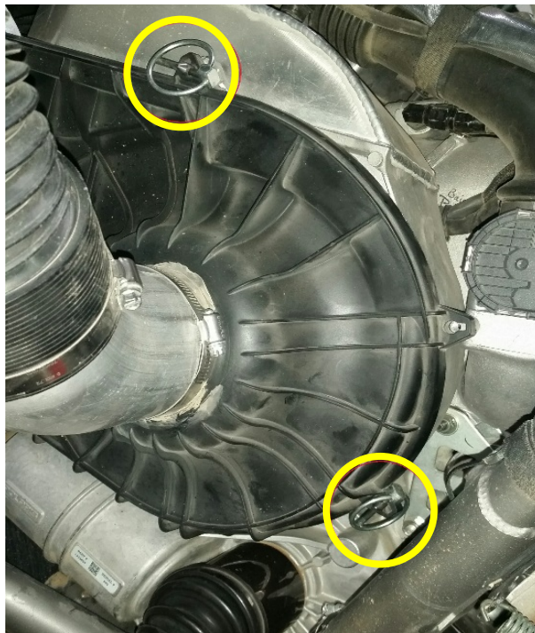
Figure 1: Installed XP Turbo Clutch Cover with Pins (Rear Pins)