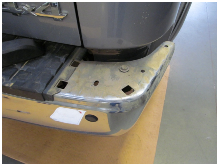
Figure 4: Passenger side Plastic cover removed from OEM bumper