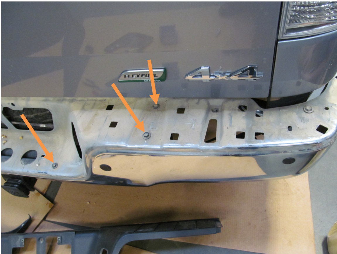
Figure 9: Location of Passenger side bolts to remove with 12mm socket/wrench