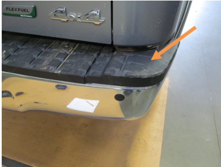
Figure 3: Passenger side plastic cover for bumper