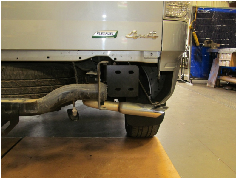
Figure 12: Front view