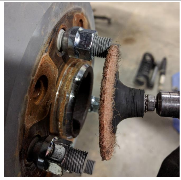
Figures 4 and 5. Cutting and Cleaning the Studs