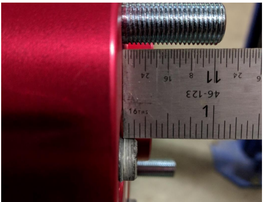
Figure 2. Measuring Stud Extension

5. If the factory stude extend beyond the face of the wheel spacer as shown in Figure 1 , then they must be trimmed. Measure how far the stude extend beyond the spacer as shown in Figure 2 .