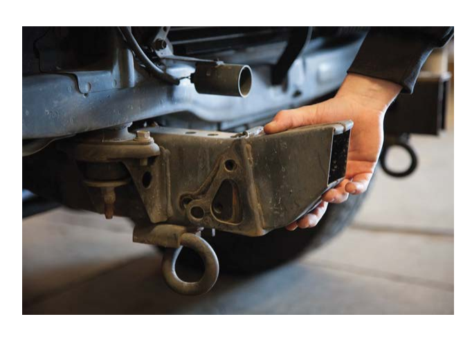
STEP 4 Slide on bumper an install with supplied hardware.