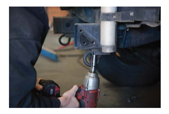
STEP 4 CONTINUED